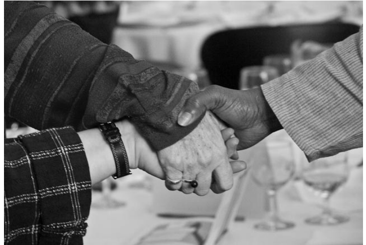
JCA Seder at Mount Zion Congregation, March 2010