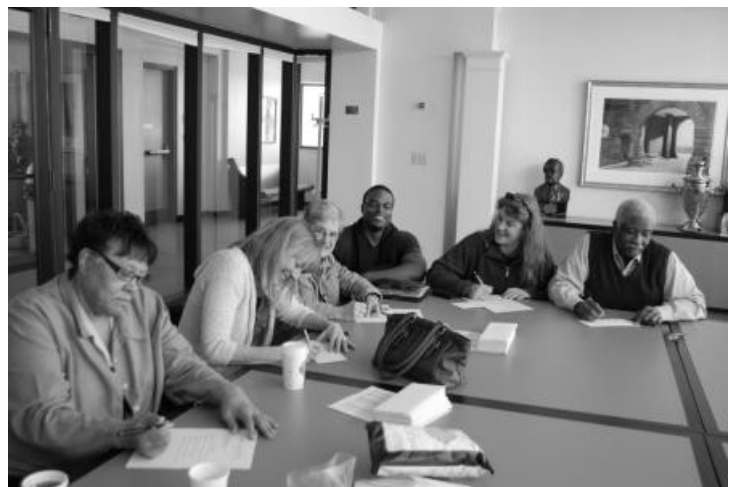
JCA and NCRC Members at Temple Israel, February 2010