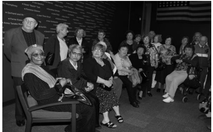
VOICE Participants at "abUSed: The Postville Raid" Screening, June 2010